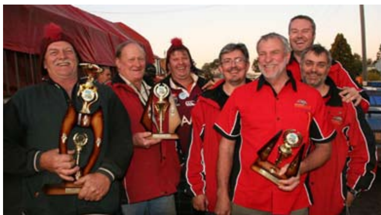
Celebrating their achievements: the three highest fundraisers, 1st Car 23, 2nd Car 81 and 3rd Car 17.