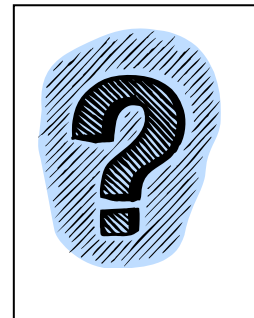
31 May 2010 (End date)